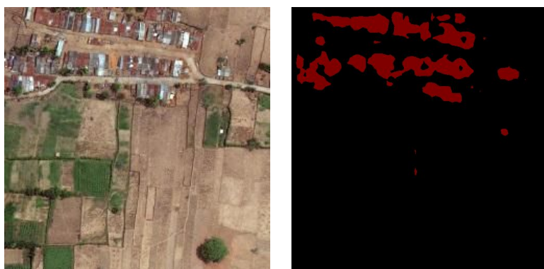
FIGURE 1: Automatic Building Extraction Using Convolutional Neural Networks